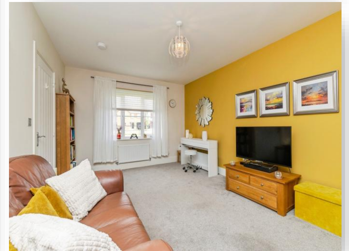
Breydon Close, Wynyard Billingham TS22 5UH