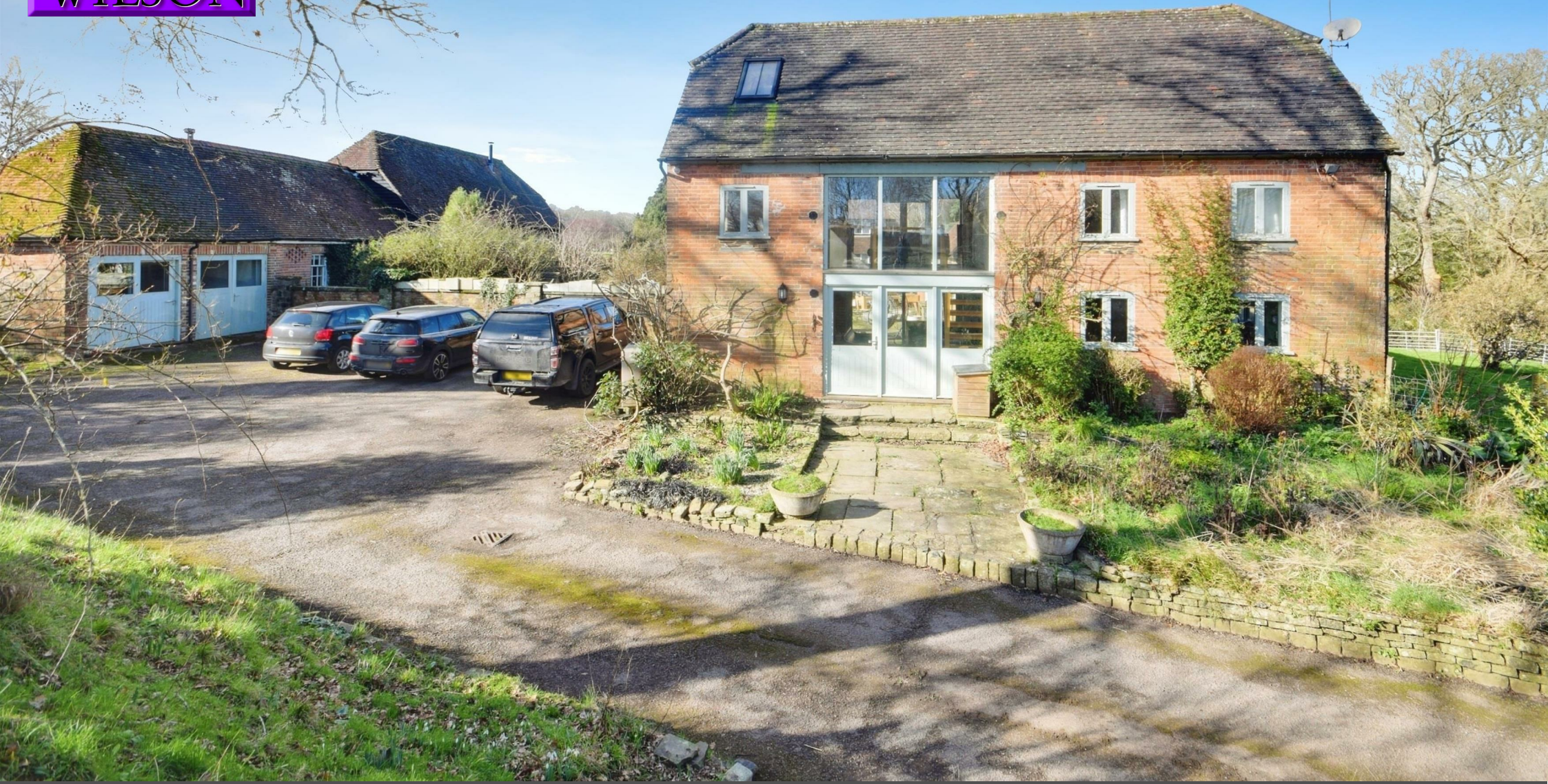
The Coach House, Harts Green, Sedlescombe, East Sussex TN33 0RS £995,000 Freehold