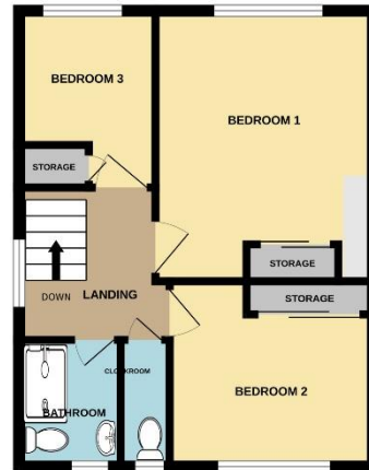
TOTAL FLOOR AREA : 797 sq.ft. (74.1 sq.m.) approx.

Whilst every attempt has been made to ensure the accuracy of the floorplan contained here, measurements of doors, windows, rooms and any other items are approximate and no responsibility is taken for any error, omission or mis-statement. This plan is for illustrative purposes only and should be used as such by any prospective purchaser. The services, systems and appliances shown have not been tested and no guarantee as to their operability or efficiency can be given. Made with Metropix ©2026