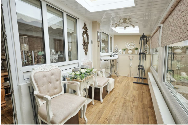
CONSERVATORY 18'4" x 6'6" (5.6 x 2)