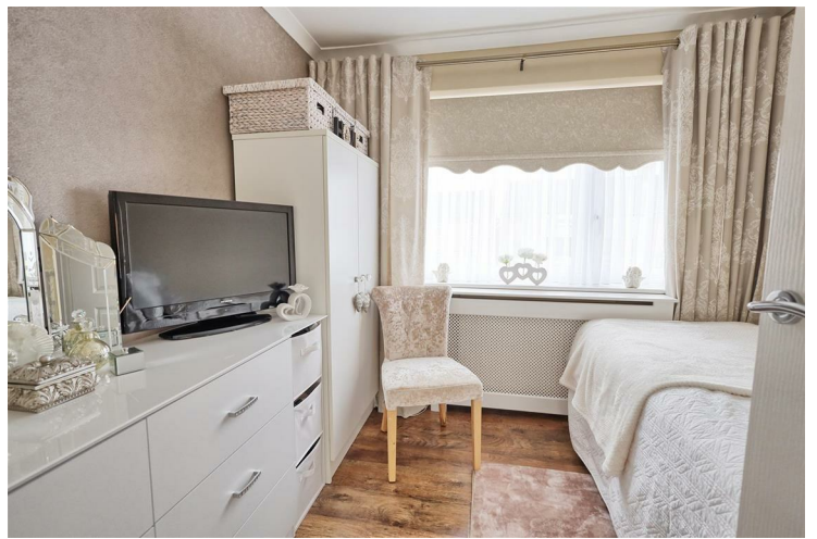
BEDROOM THREE 8'10" x 8'2" (2.7 x 2.5)