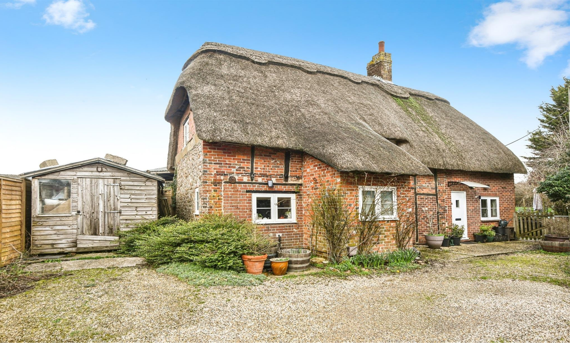
Kingscote Cottage High Street, Upper Lambourn HUNGERFORD RG17 8QT