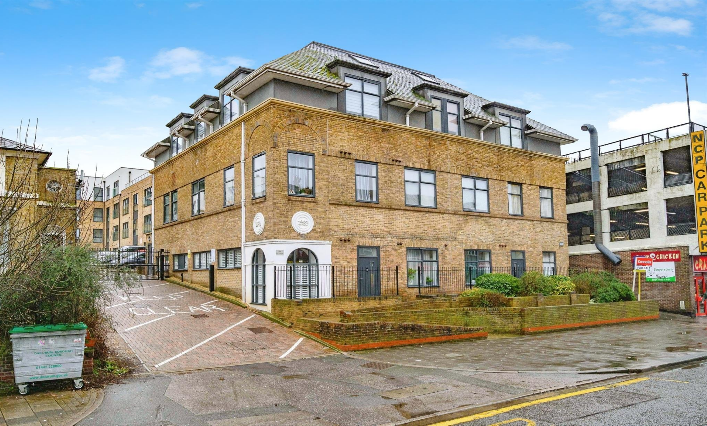
The Exchange Marlowes, Hemel Hempstead HP1 1EH