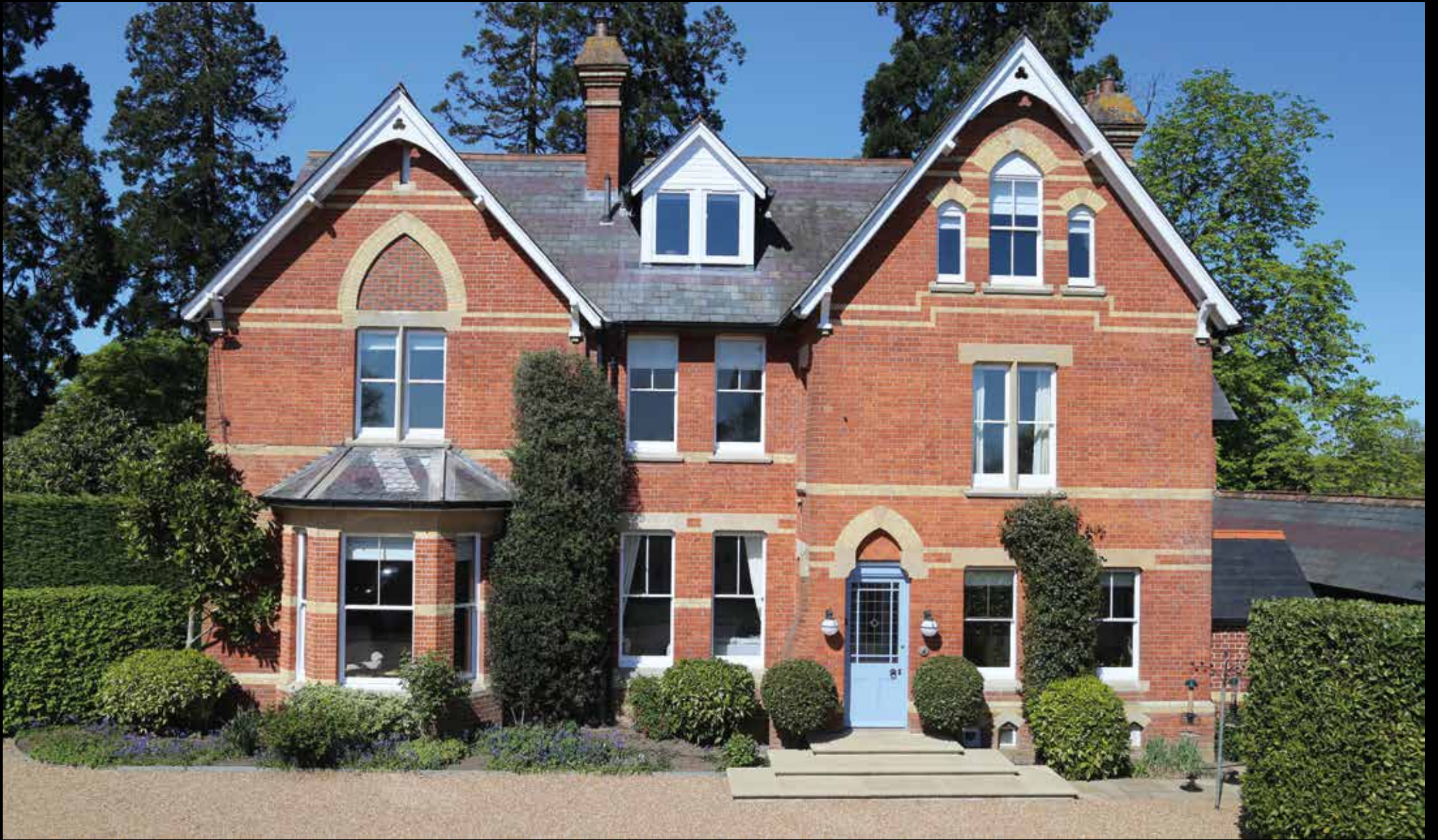
2 Leigh Court Three Elm Lane | Golden Green | Tonbridge | TN11 0LJ