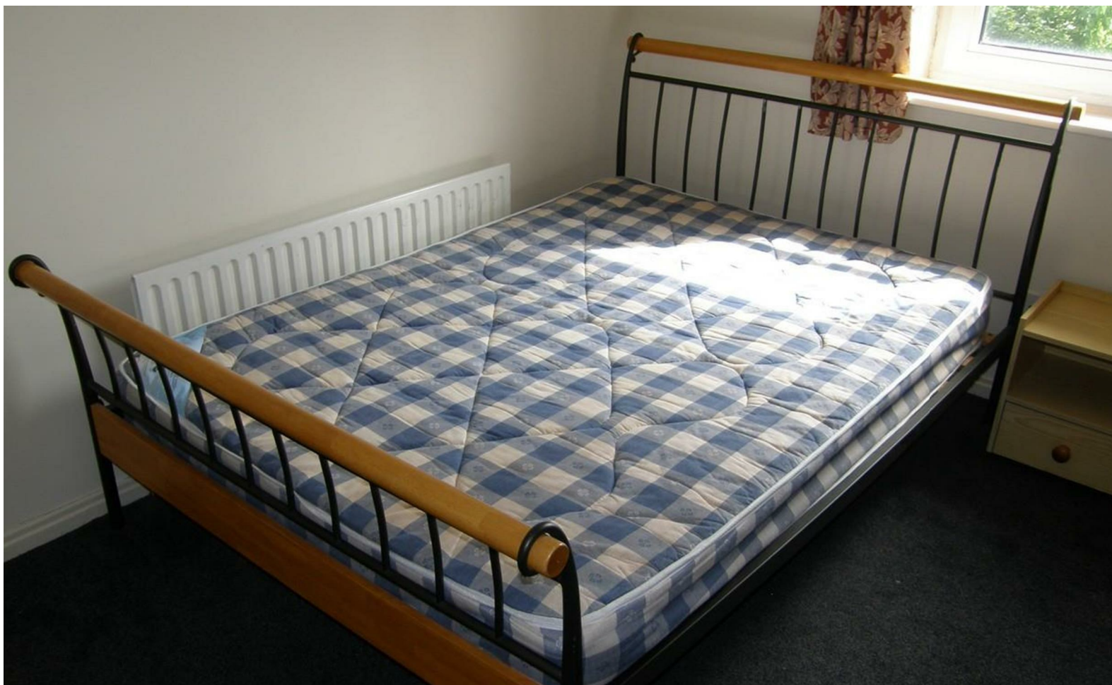
Bedroom 5 13'9" x 16'0" (4.2m x 4.88m) 16.23m 2