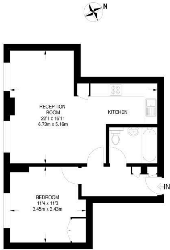
THIRD FLOOR 498 SQ FT / 46.3 SQ M