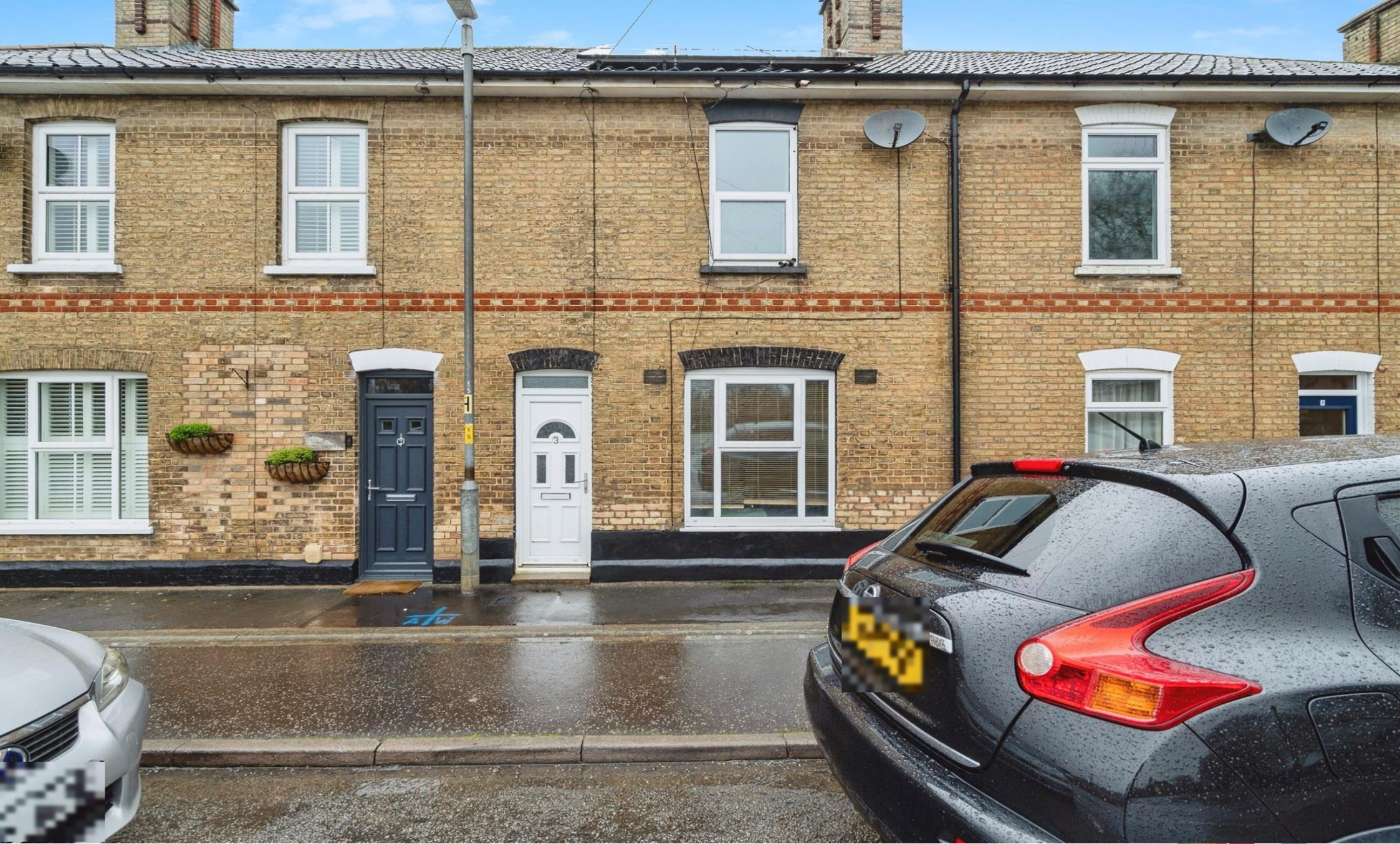
The Terrace Norwich Road, Scole Diss IP21 4DY