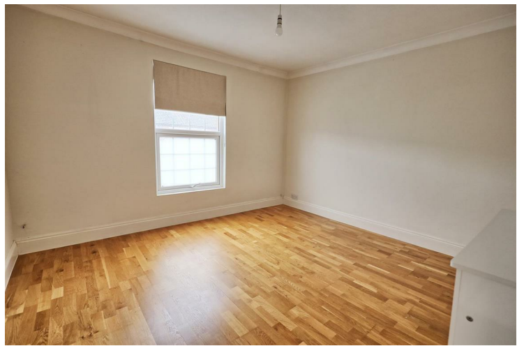
BEDROOM ONE 12'1" x 10'9" (3.7 x 3.28)