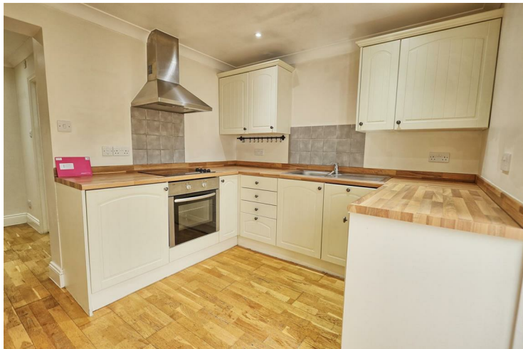
KITCHEN 10'7" x 9'0" (3.23 x 2.74)