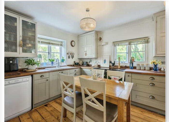
Battershill House Arcadia Road, Elburton PL9 8EG