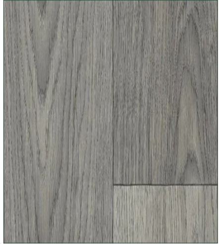
Sabine AA710 vinyl flooring