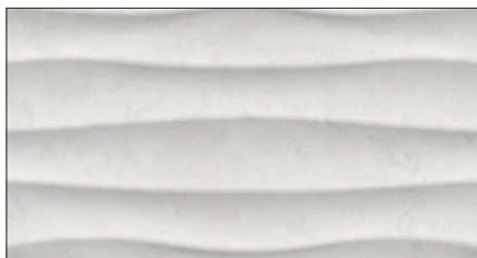
Marbles versus cream décor tiles