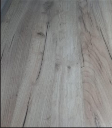
Farmhouse Oak worktop