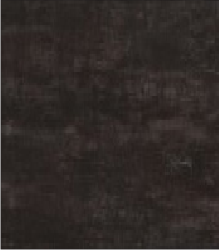
Carbon Steel worktop