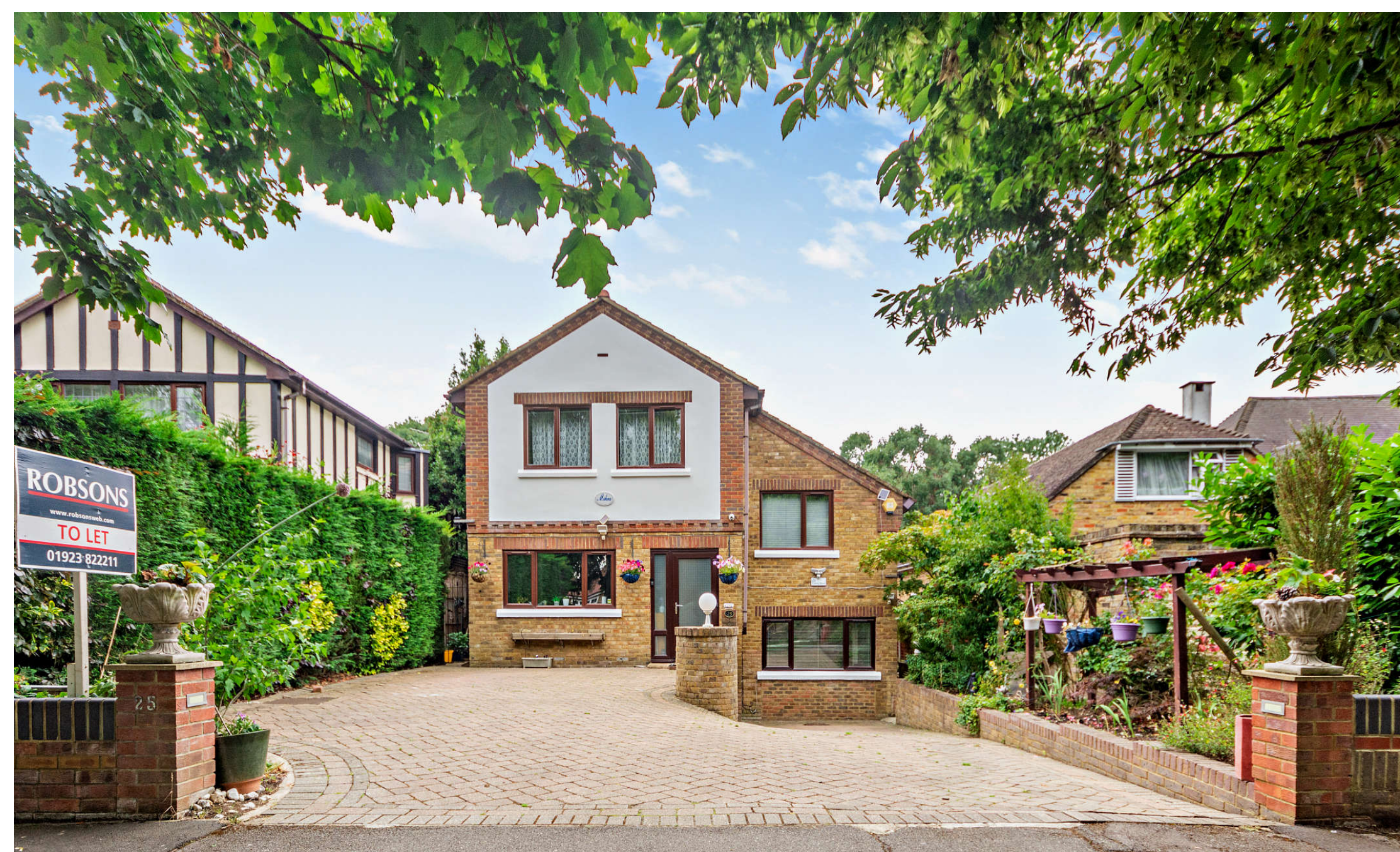
A detached four bedroom, four bathroom house located on this sought after road. Cheney Street, Pinner, Middlesex HA5 2TG