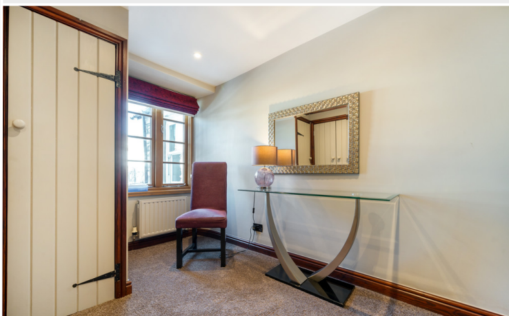
Bedroom 2/Dressing Room