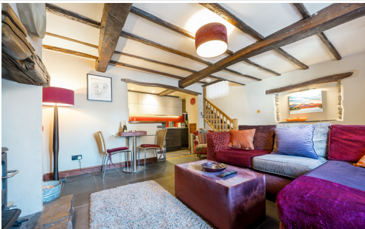
Open Plan Living Room