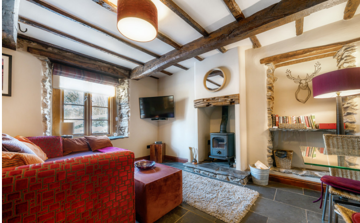
Open Plan Living Room