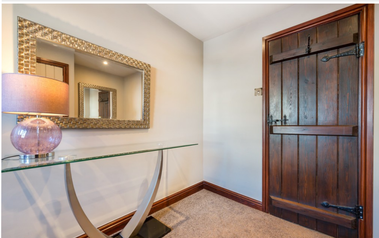
Bedroom 2/Dressing Room