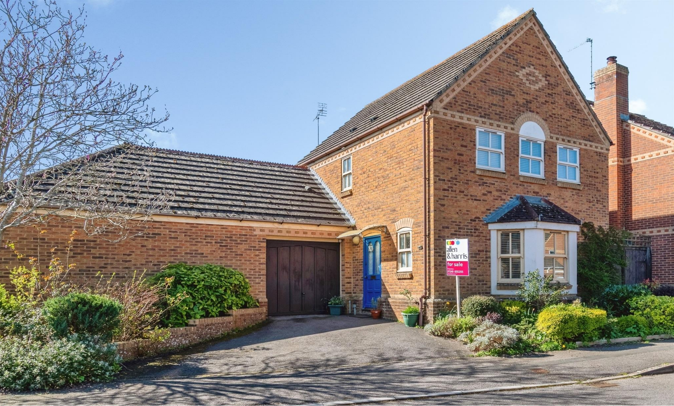
Willowbank, Chippenham SN14 6QG