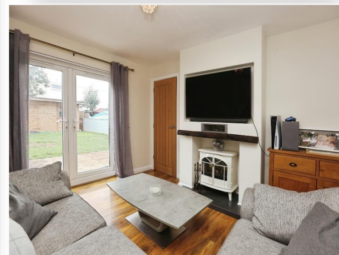
Rodney Close, Gosport PO13 8EJ