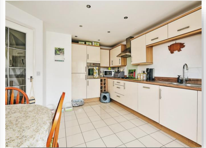
Briar Court, Yaxley Peterborough PE7 3GL