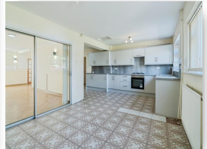
Marydene Drive, Leicester LE5 6HE