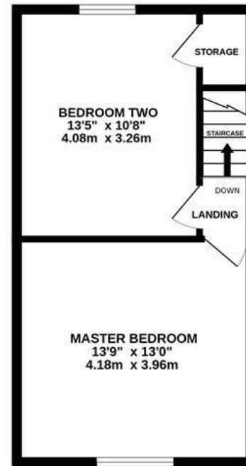
1ST FLOOR 362 sq.ft. (33.6 sq.m.) approx.