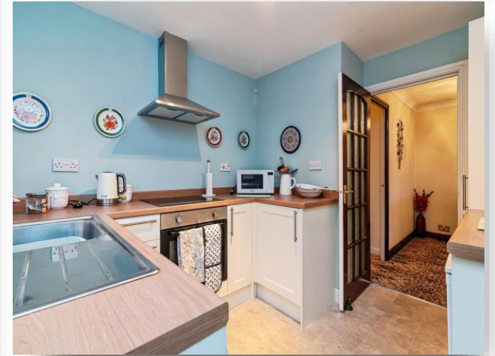
West View, West Bridgford Nottingham NG2 7LS