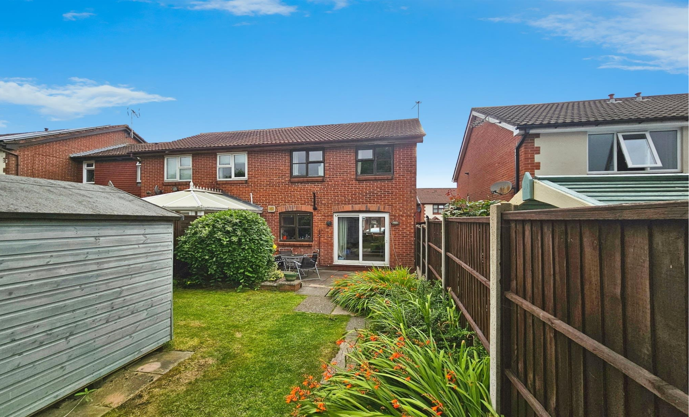
Victoria Close Whitwick Coalville