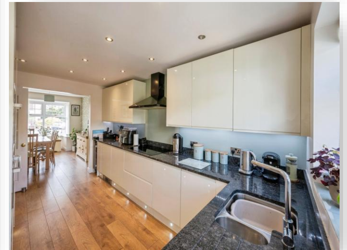
Yearling Chase, Swinton Mexborough S64 8XA