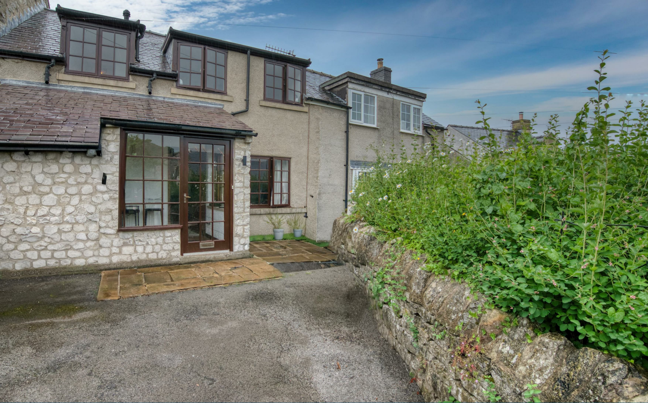
Rambler Cottage High Street, Calver Village, Hope Valley, S32 3XP