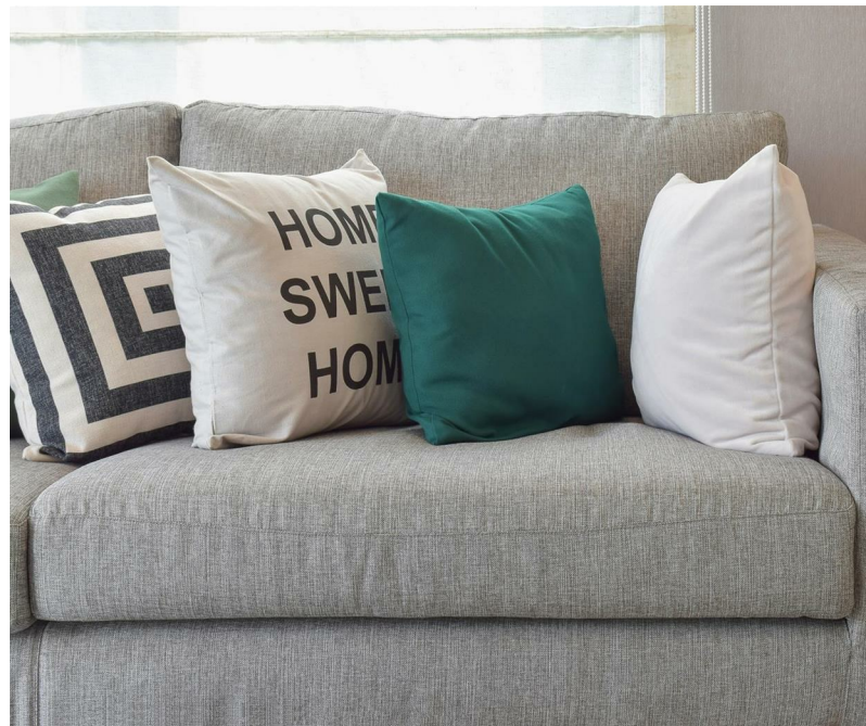
Lister Close, Chippenham