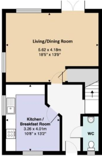
Ground Floor Area: 46.9 m 2 ... 505 ft 2