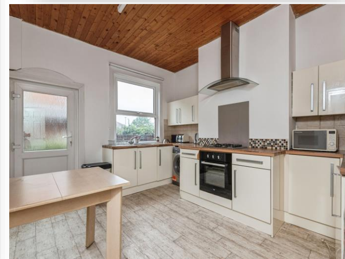
Wesley Street, Morley Leeds LS27 9ED