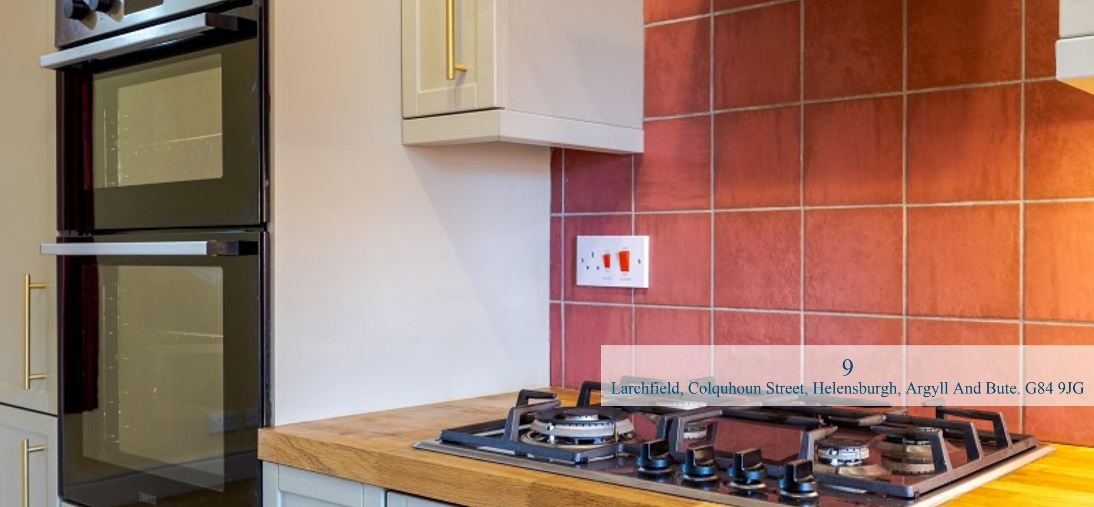
9 Larchfield, Colquhoun Street, Helensburgh, Argyll And Bute. G84 9JG