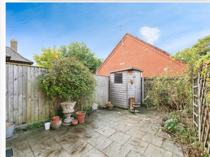
Oak Court Barons Close, Fakenham NR21 8FB