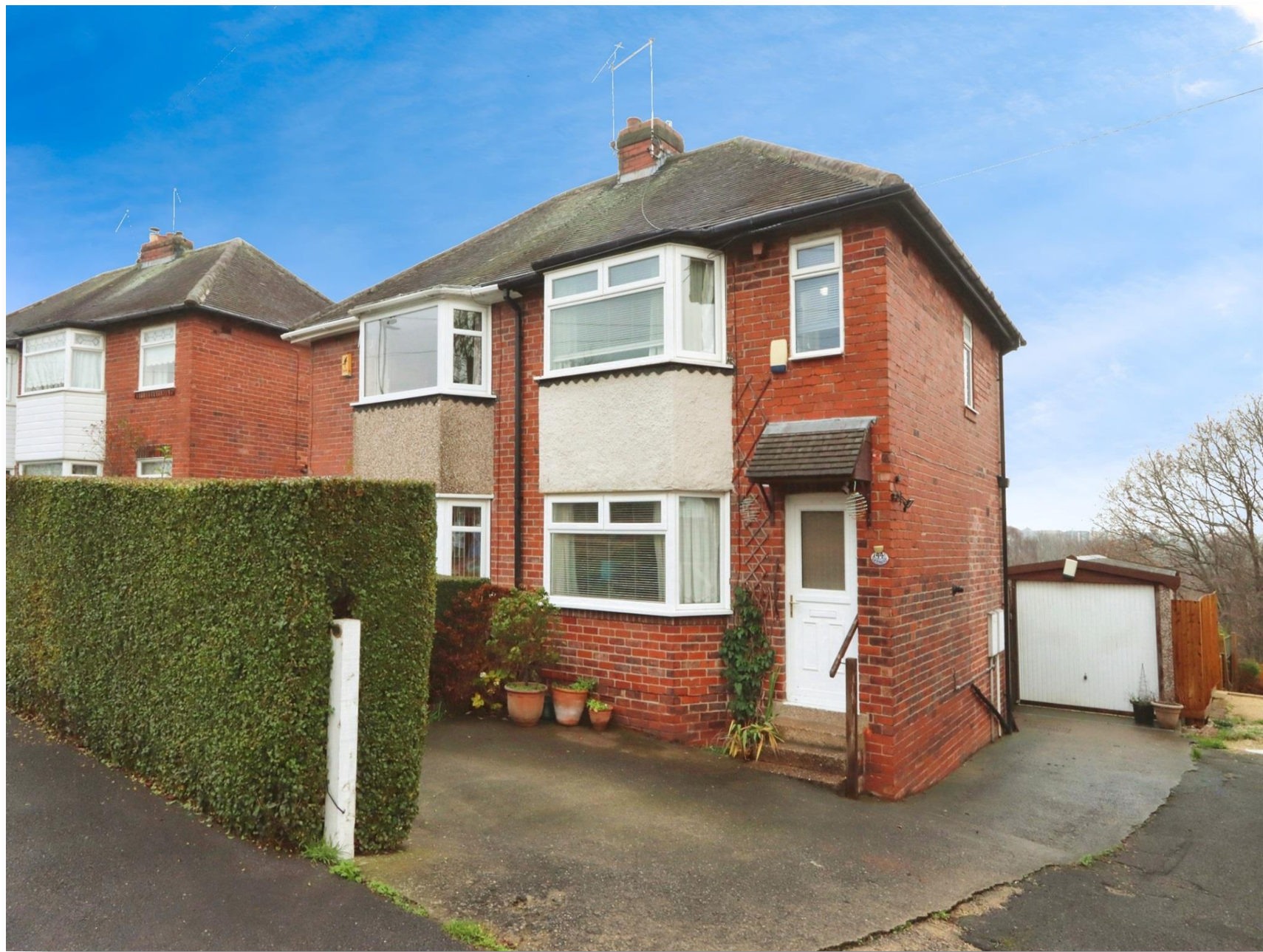
Alport Road, Frecheville Sheffield S12 4RX