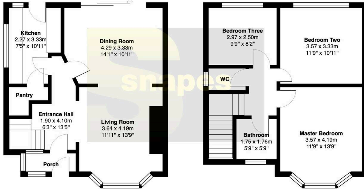
Ground Floor Area: 48.6 m 2 ... 523 ft 2