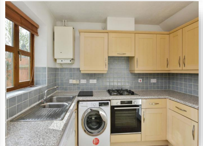
Benacre Croft, Tattenhoe Milton Keynes MK4 3FG