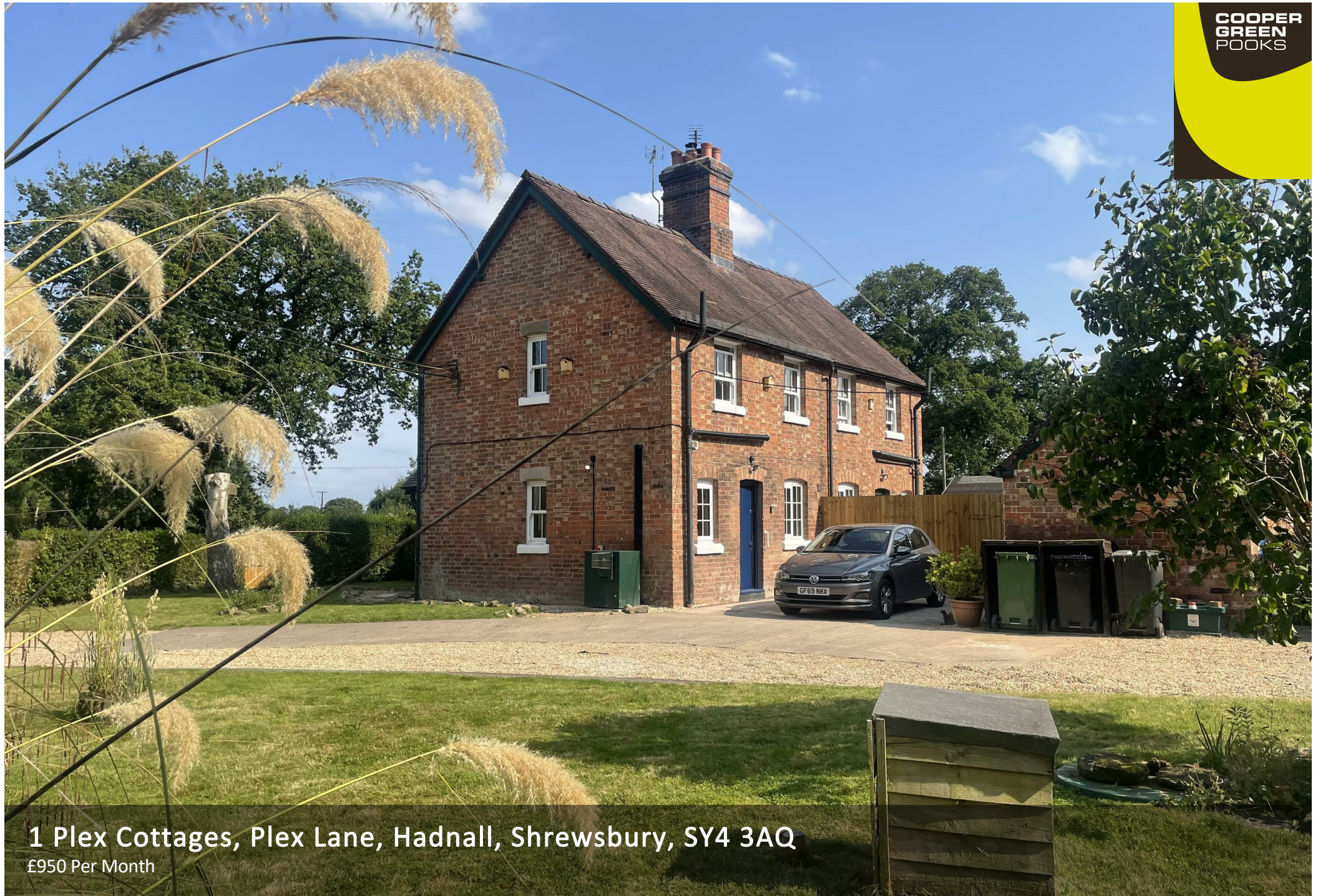
1 Plex Cottages, Plex Lane, Hadnall, Shrewsbury, SY4 3AQ £950 Per Month