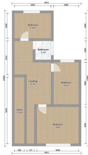
Warwards Lane First Floor