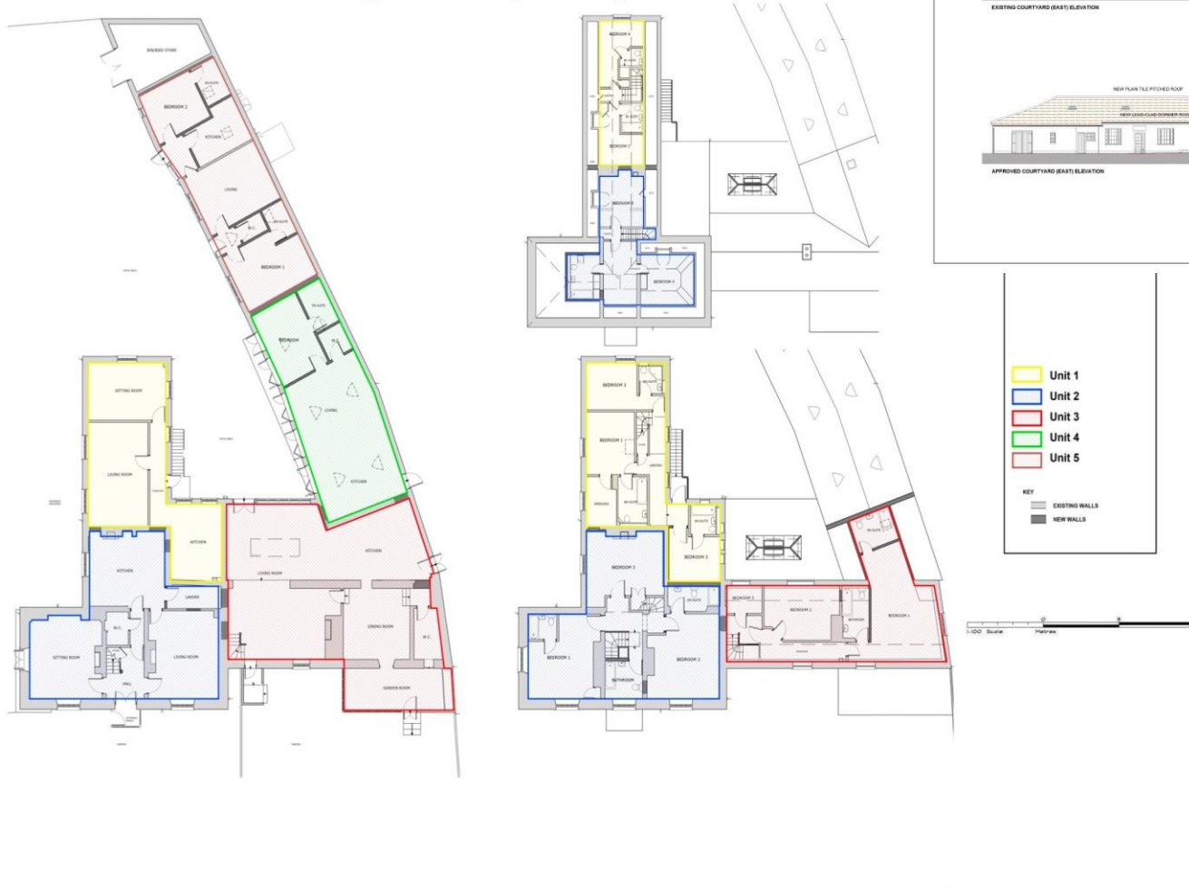
Worgret Manor - Proposed Floorplans with five units

Proposals include a pitch roof over the current bar and restaurant area, partitioned to create two cottage dwellings. The main Manor House lends itself to a range of configurations with a simple option to split the main T-plan building into two substantial townhouses included in the current planning application.