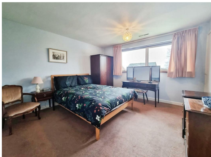
Bedroom One 13'5 x 12'0 (4.09m x 3.66m)