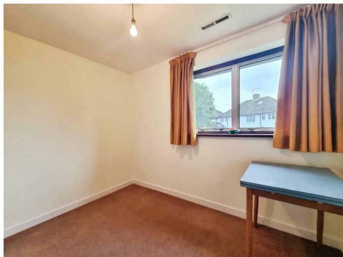
Bedroom Four 9'5 x 7'8 (2.87m x 2.34m)