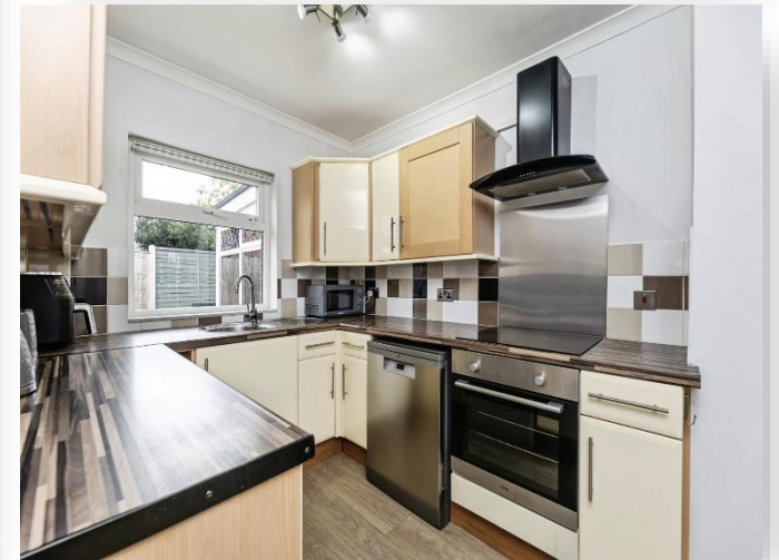
Smithy Lane, Tingley Wakefield WF3 1QH