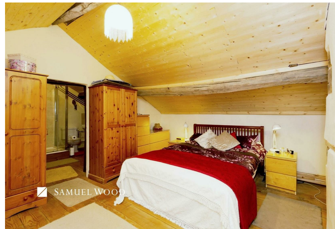
✓ SAMUEL WOOD