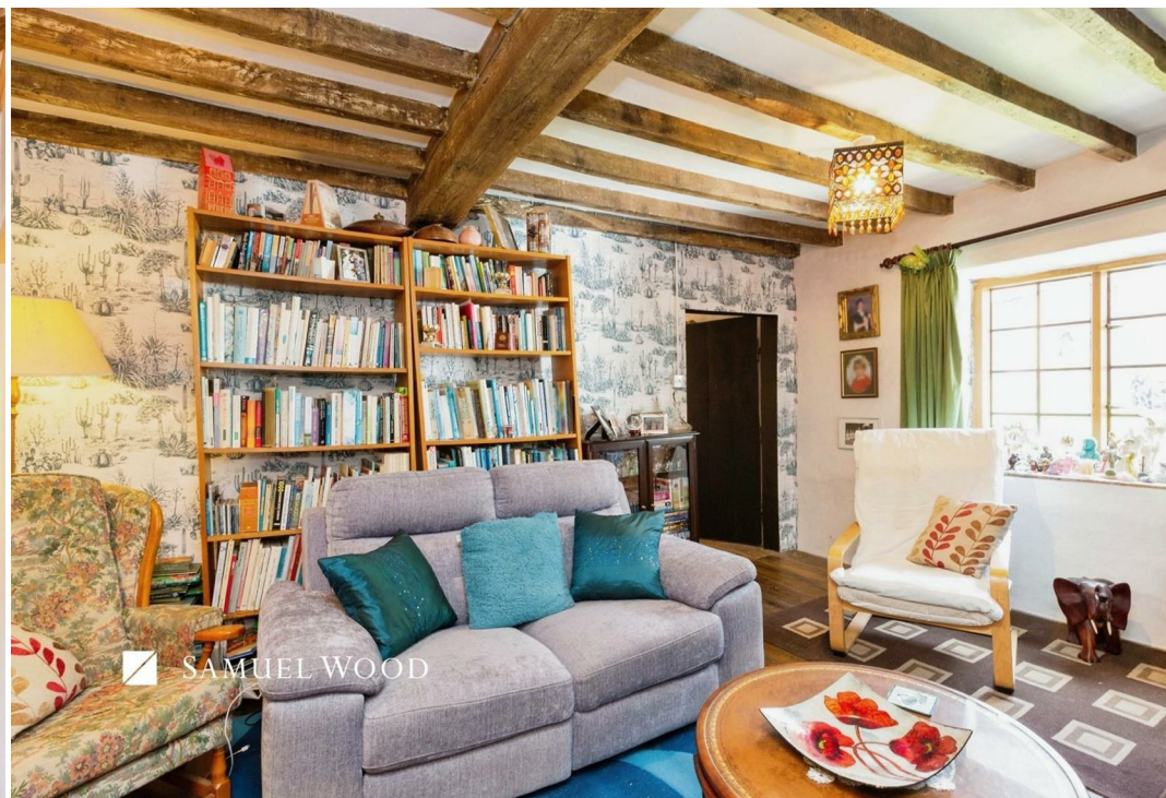
✓ SAMUEL WOOD