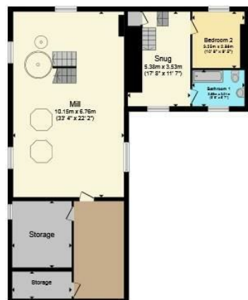
Mill House - First Floor