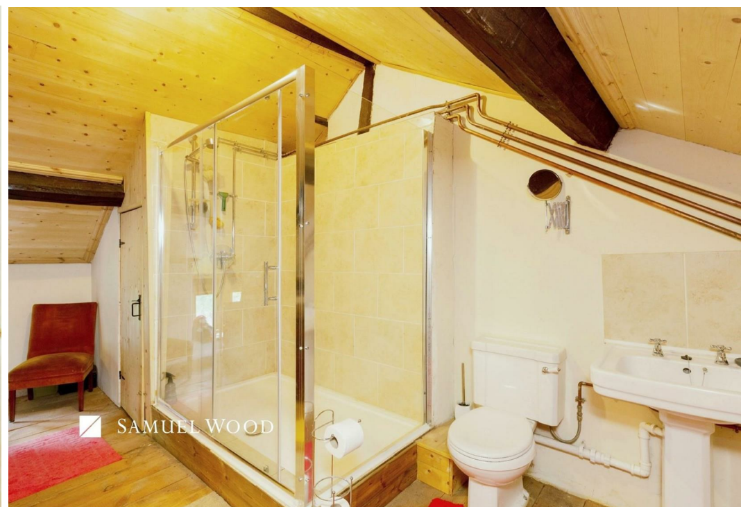
✓ SAMUEL WOOD