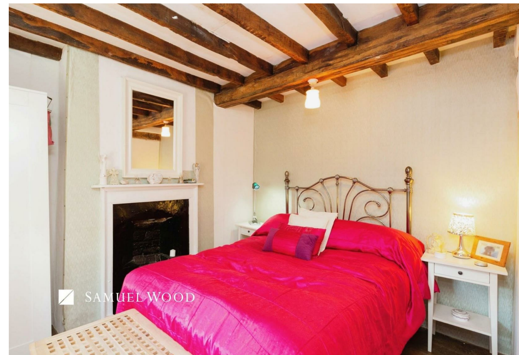
✓ SAMUEL WOOD