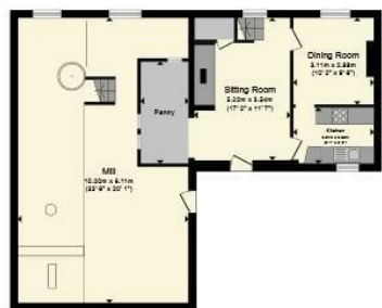
Mill House - Ground Floor