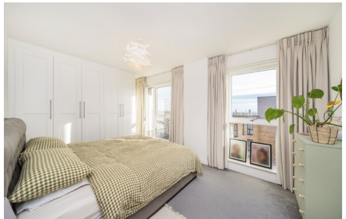
Rowland Road, N17