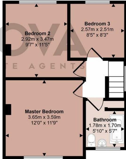
First Floor Approx 39 sq m / 425 sq ft

This floorplan is only for illustrative purposes and is not to scale. Measurements of rooms, doors, windows, and any items are approximate and no responsibility is taken for any error, omission or mis-statement. Icons of items such as bathroom suites are representations only and may not look like the real items. Made with Made Snappy 360.