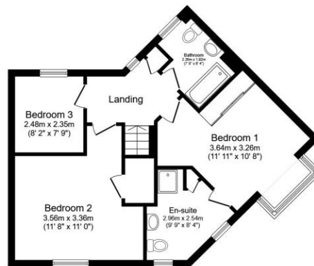
First Floor Floor area 54.3 sq.m. (585 sq.ft.)

Total floor area: 108. sq.m. (1,158 sq.ft.)