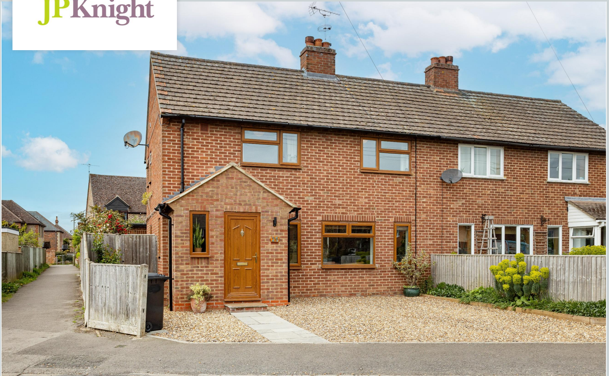
St. Nicholas Road, Wallingford, OX10 8HU