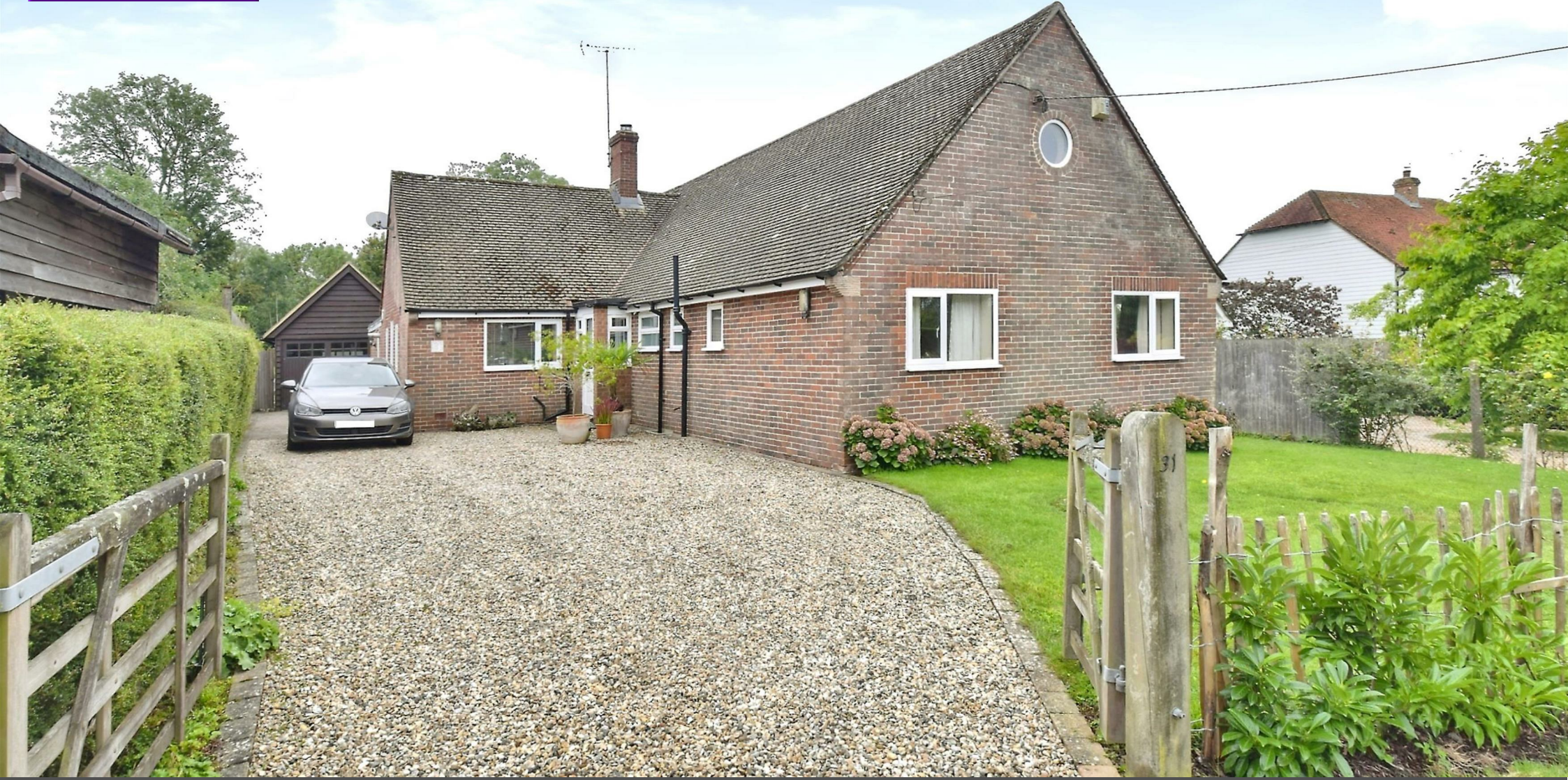
'Little Meads' 31 Swan Street, Wittersham, Kent TN30 7PH Offers In Excess Of £625,000 Freehold