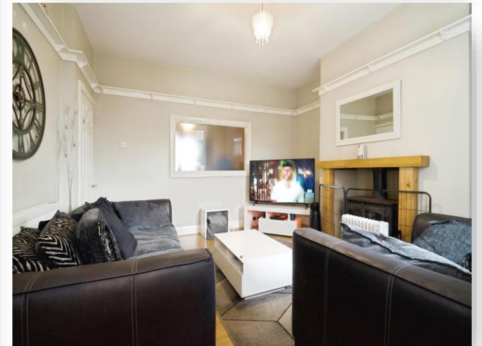
Green Lane, Barnburgh Doncaster DN5 7HR