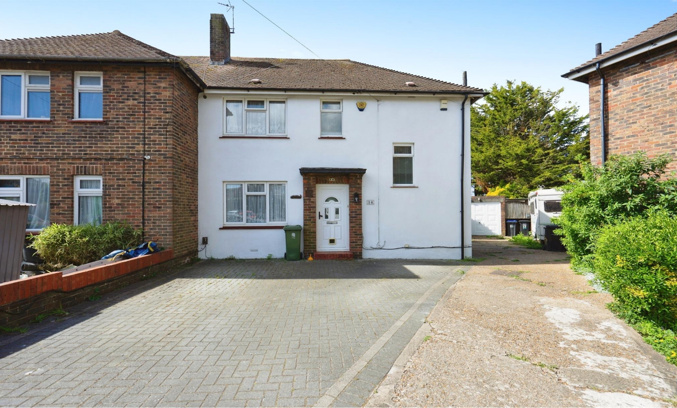
Meadow Close, Southwick BRIGHTON BN42 4NX