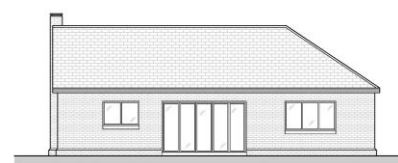
Proposed East Elevation 1:100