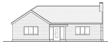
Proposed West Elevation 1:100