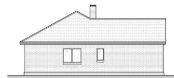
Proposed North Elevation 1:100