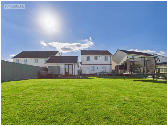
Invicta House, The Pill, Kingsley Road, Bideford, Devon EX39 2PF