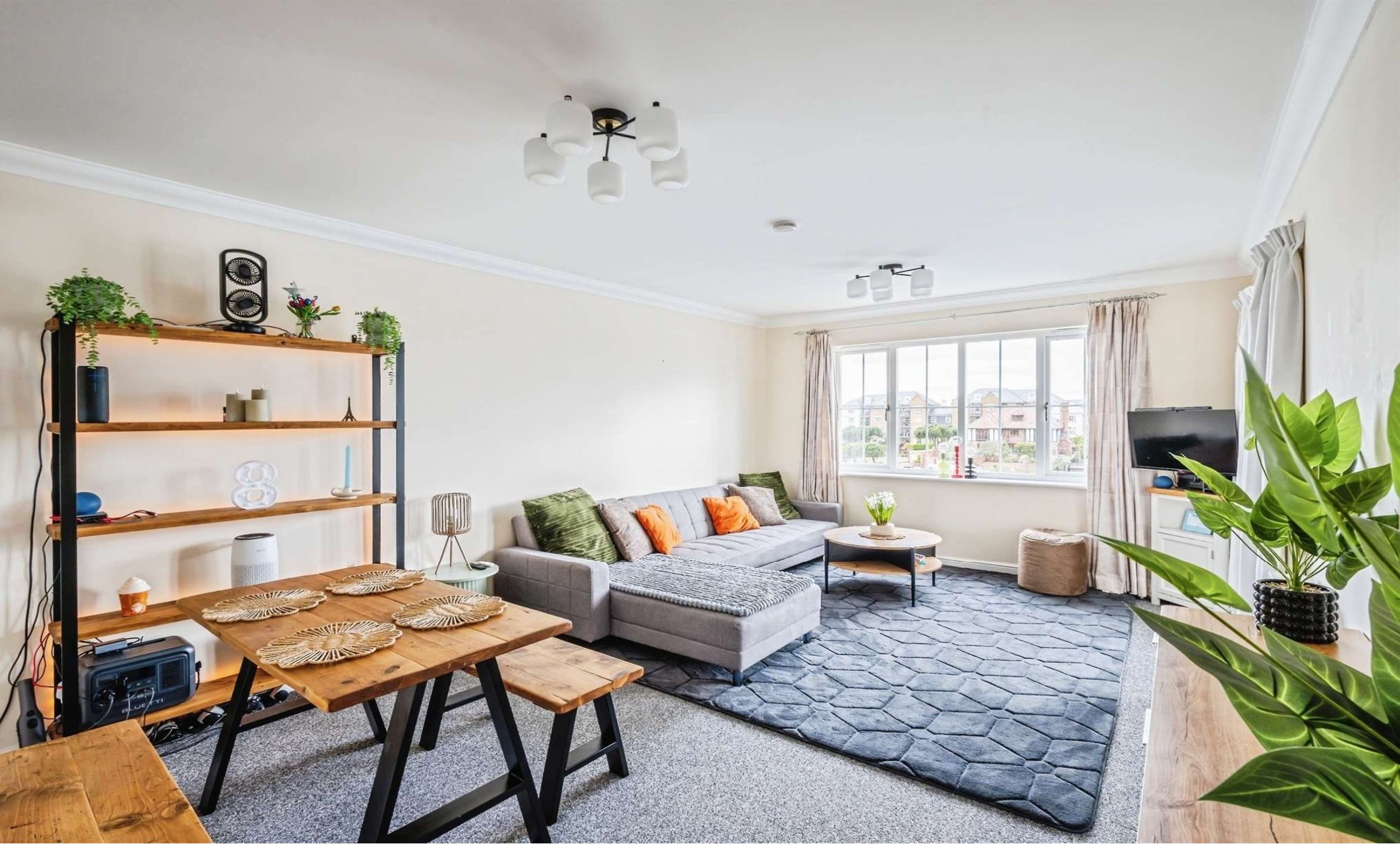
Pacific Heights North Golden Gate Way, Eastbourne BN23 5PT