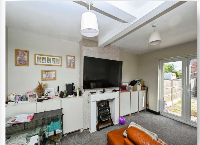
Woodside Place, Clay Cross Chesterfield S45 9PW