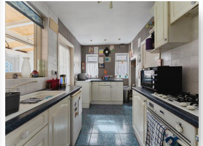
Glenwood Road, Little Sutton Ellesmere Port CH66 3SD